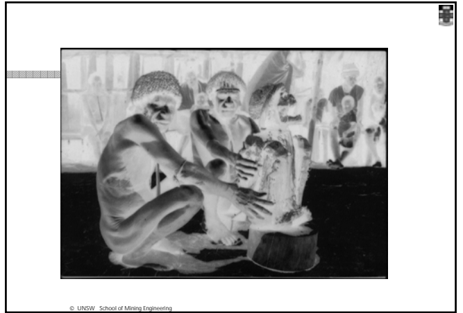
© UNSW School of Mining Engineering