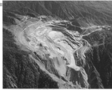
Ok Tedi Mine – mine pit area.