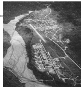
Ok Tedi - Tabubil township and airstrip