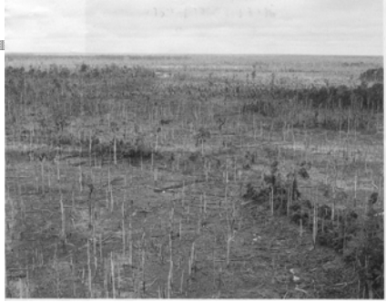
Fly River Delta area – overbank flooding impact, dieback.