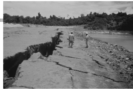
Omai Tailing Storage Failure, Guyana 1995 – Photo shows embankment after failure.