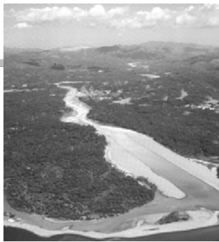
Marcopper tailing storage tunnel failure after an earthquake event, March 1996, Philippines – the dredge channel was used to trap tailings which discharged down the Boac River from the failed tailings storage.